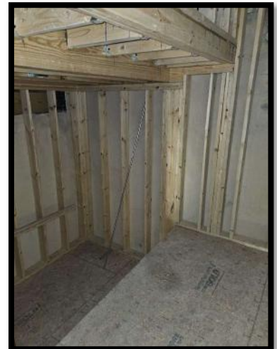
Room is two-levels to accommodate the airflow