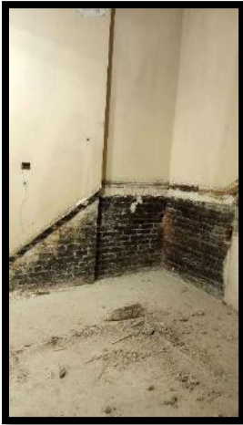
Prepping for bathroom addition. This is the space under the west choir steps.