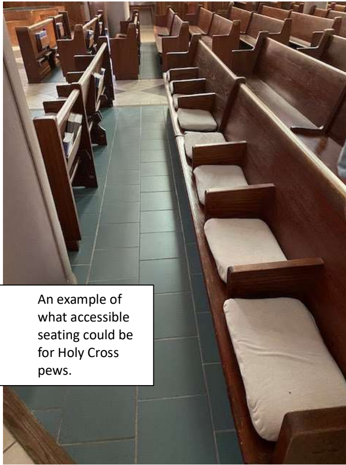
An example of what accessible seating could be for Holy Cross pews.