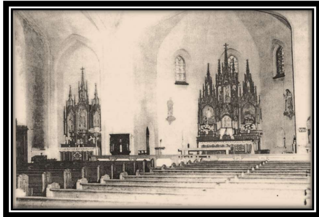
Altar Above in Current Church 1931-1966