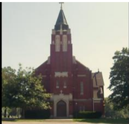
+ HOLY CROSS WENDELIN