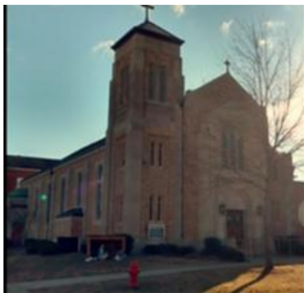
+ ST. JOSEPH OLNEY