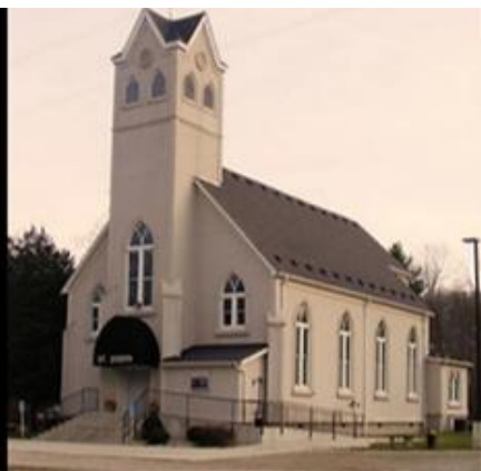
+ ST. JOSEPH STRINGTOWN